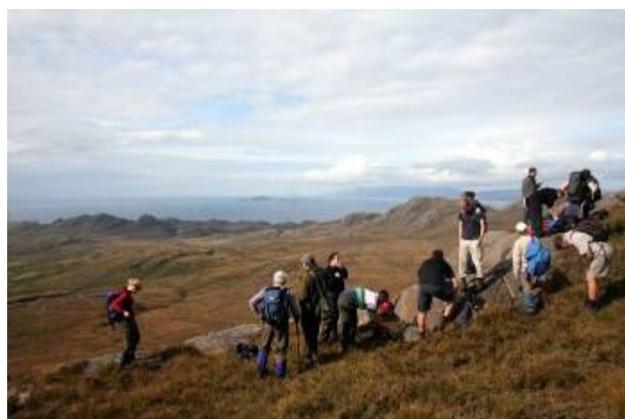
The centre 3 gabbros of Ardnamurchan.