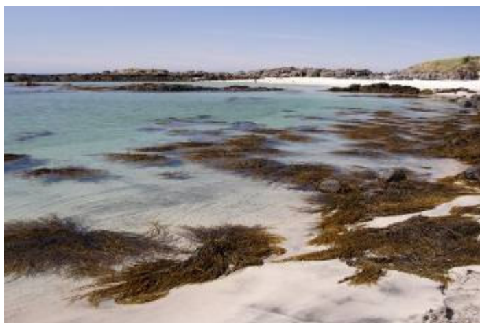
Typical Scottish weather in September!